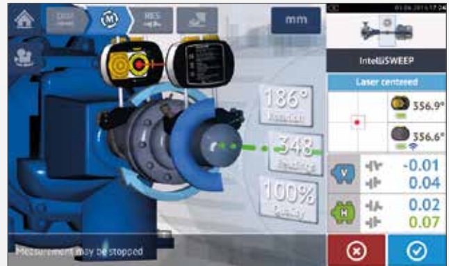
As shafts are rotated, measurement quality is clearly displayed – a green or blue sector indicates good measurement data.

As shaft rotates, hundreds of real measurement points are taken automatically. The results are far more accurate than those based on 3 measurement positions.